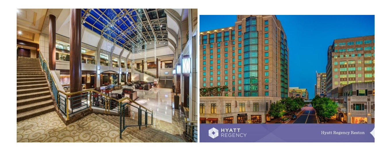
Stay comfortably in our Reston Town Center Hotel

HYATT REGENCY RESTON TOWN CENTER 1800 PRESIDENTS STREET, RESTON, VIRGINIA – 20190 Room Reservations (Non-Package Guests) - (800) 233-1234 (Mention the "Virginia State Dance Event" to receive our discounted rate!)